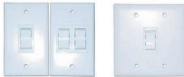
Custom Rocker Switches

Elero offers several styles of switches for motorized awnings, including custom options.