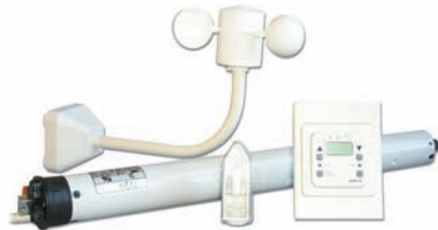
Mini Weather Station