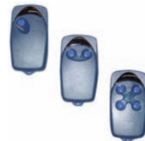
Handsenders for Radio Receiver

Control your awning from inside or outside the house with an easily programmable handsender.