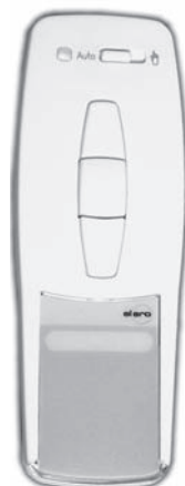
Aero 915 and LumeroTel

The Aero 915 is a single-channel wireless sun and wind sensor. The LumeroTel is a single-channel decorative transmitter that is used in conjunction with the Aero 915.